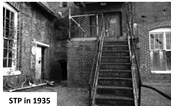
STP in 1935

STP Limited, (formerly known as Shalimar Tar Products Limited) has been pioneer of Waterproofing in India. Established in 1935, STP has a proven track record of 80 years and enjoys trust of its customers as a company providing “Total Solution, Total Protection”. STP commands tremendous brand image build assiduously through timely delivery of quality product at competitive price through continuous R&D duly backed by highly educated technical service team with vast experience.