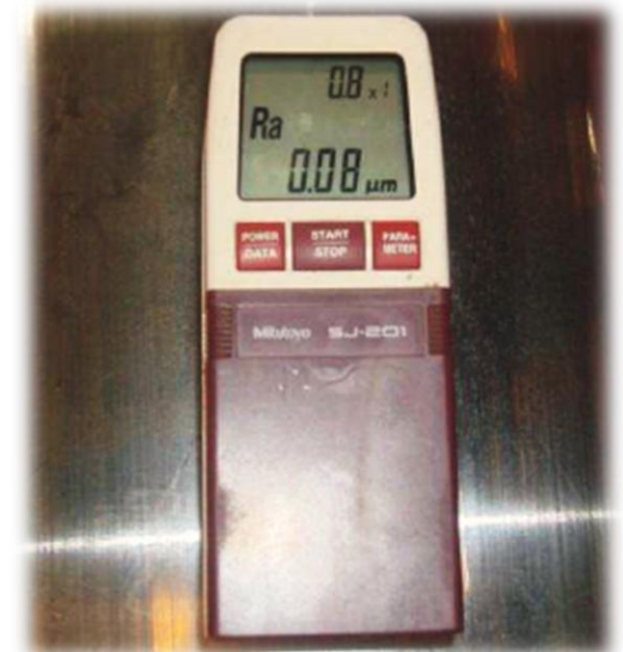
These images have been taken during active inspections.