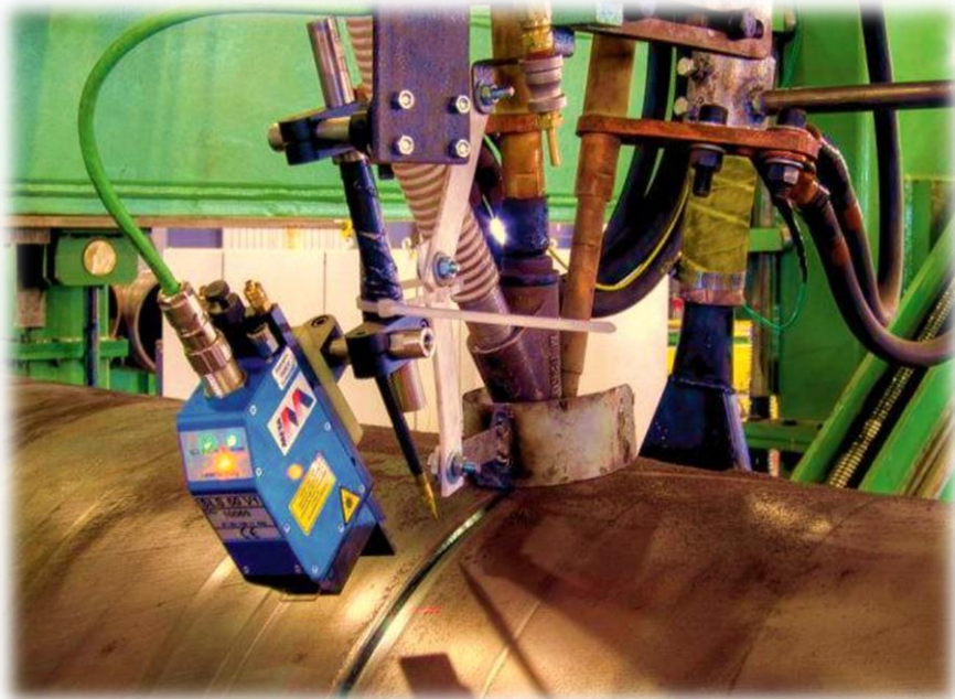
Submerge Arc Welding Machines

United Van Der Horst has approved WPS (Welding Procedure Specification) from third parties like ABS, DNV, IRS with the capacity to handle welding components in excess of 10 tons, Capable for entire spectrum of welding like SMAW, SAW, GTAW, MMAW, TIG, MIG over a wide range of products