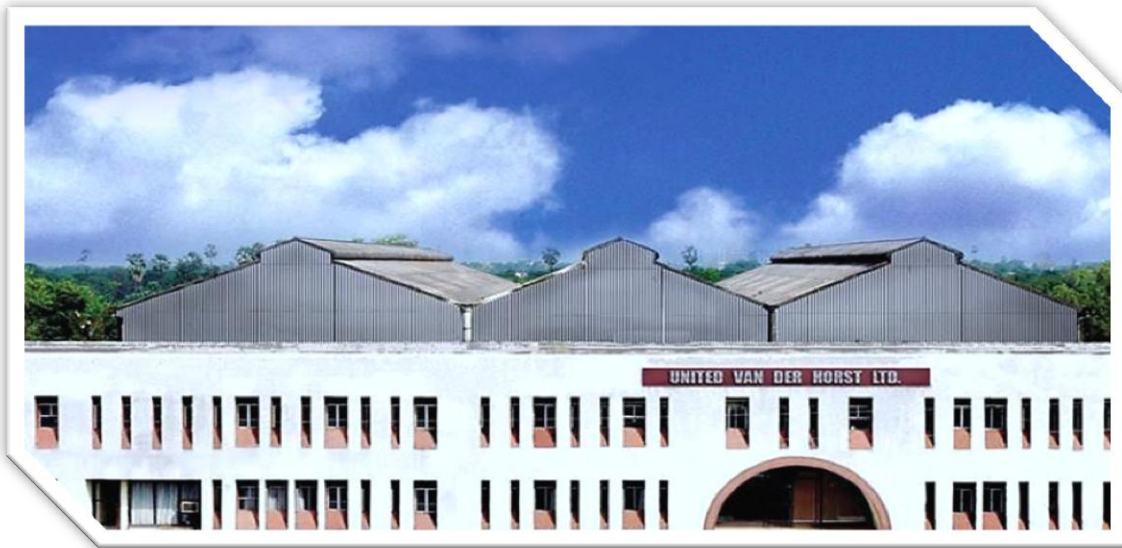
TALOJA (NAVI MUMBAI)

Our central location is close to the port and the highways allowing customers to have easier access to our facilities or vice versa