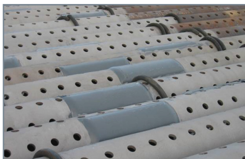
On perforated casing