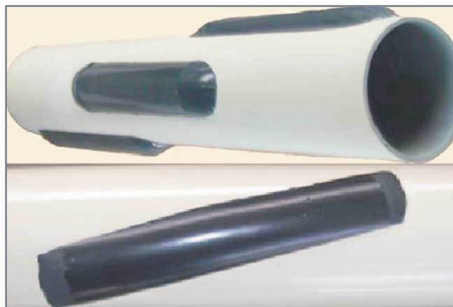
Protech CRB Centralizers