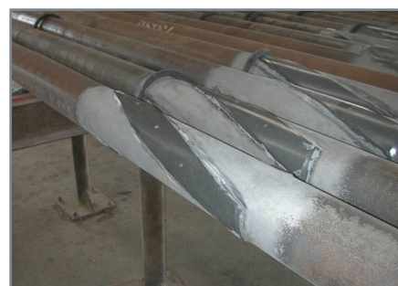
Protech CRB rigid centralizers

For more information about Halliburton's Protech DRB™ and Protech CRB™ Centralizer Service please contact your local Halliburton representative.