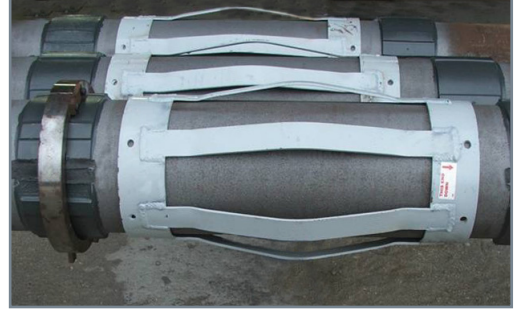
Integral bow spring centralizers