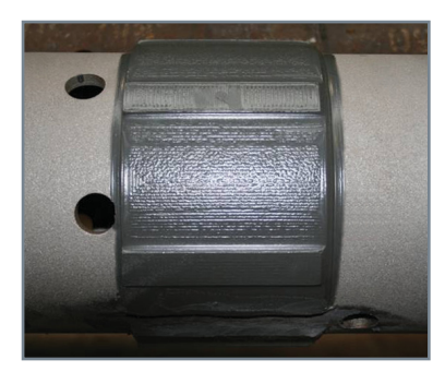
Slotted liner hanger application