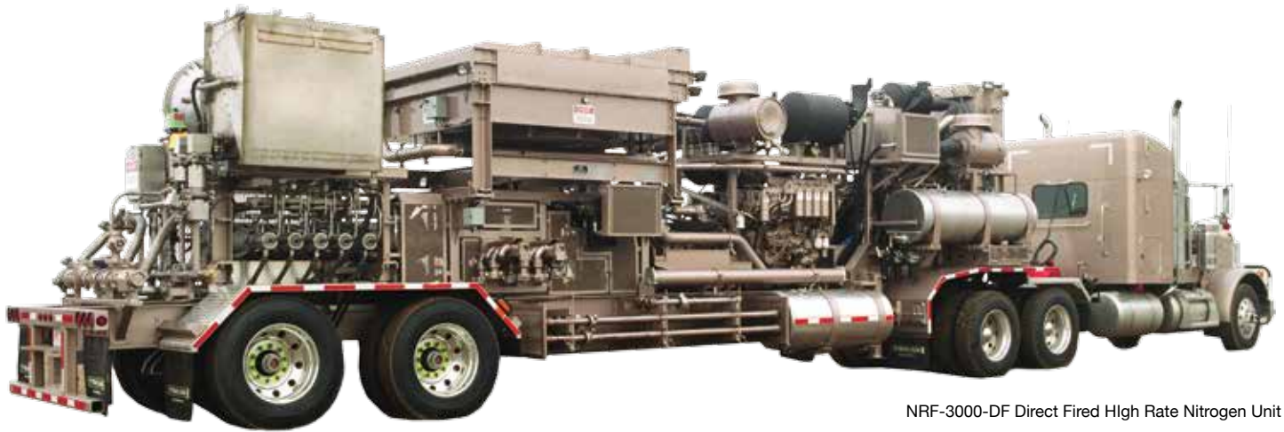
NRF-3000-DF Direct Fired High Rate Nitrogen Unit