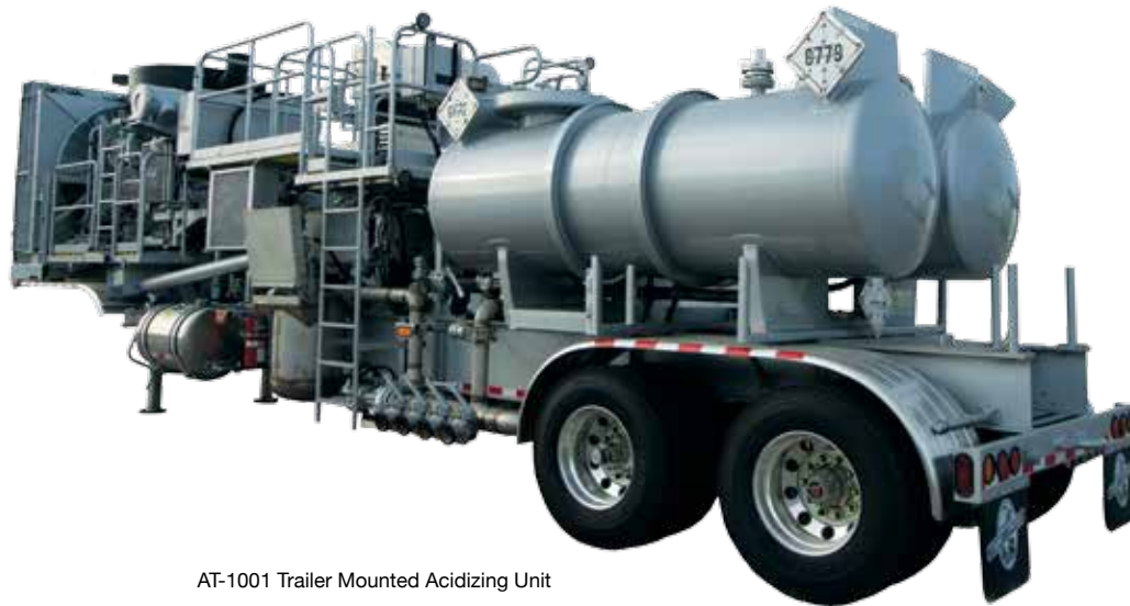
AT-1001 Trailer Mounted Acidizing Unit