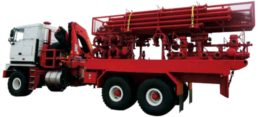
Truck Mounted Manifold and Iron Transport