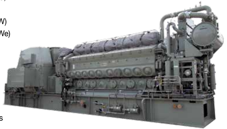
EMD 20-710 Offshore Generator