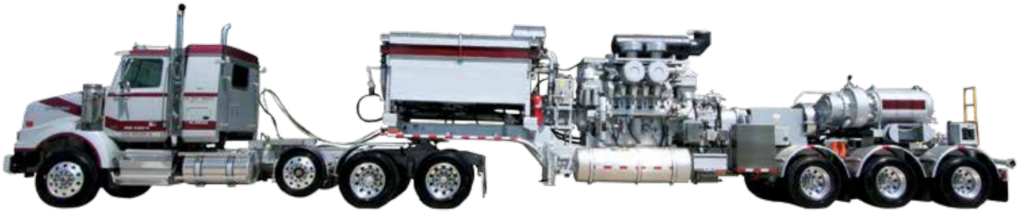
FT-2251 Trailer Mounted Fracturing Unit