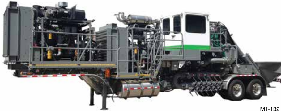
MT-132 Trailer Mounted Fracturing Blender