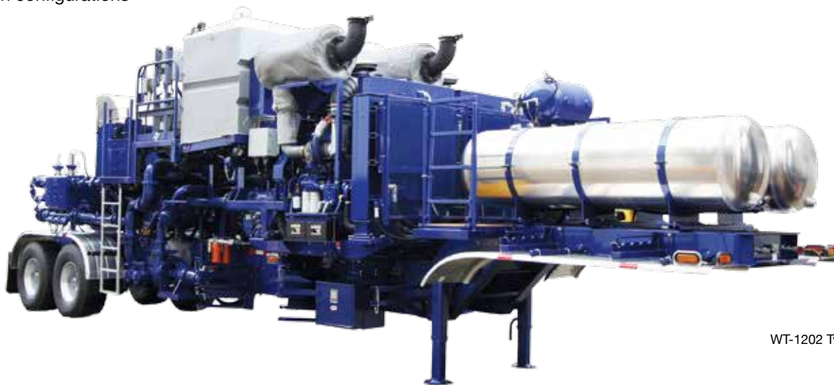
WT-1202 Twin Pumper