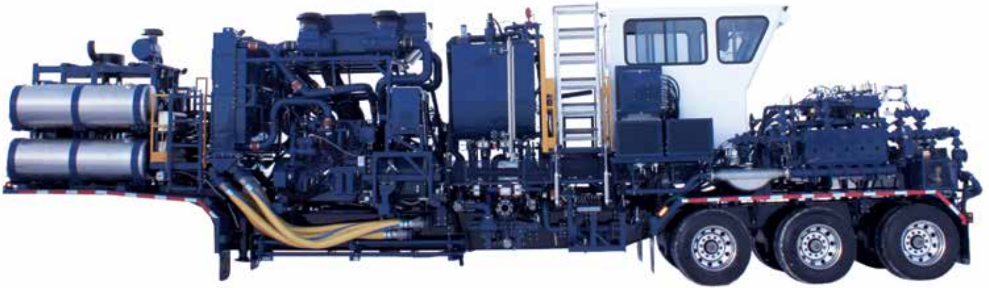
PRW-2000 Twin High Rate Pumper