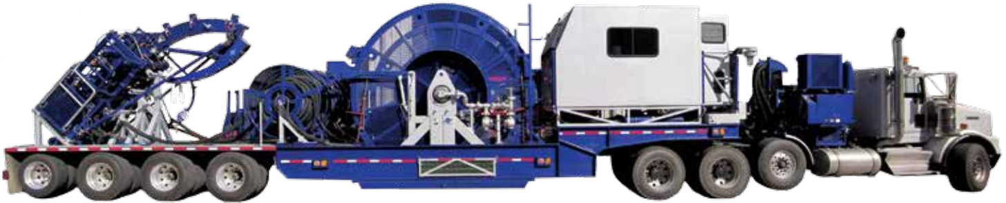
TT-100-XC Coiled Tubing Unit