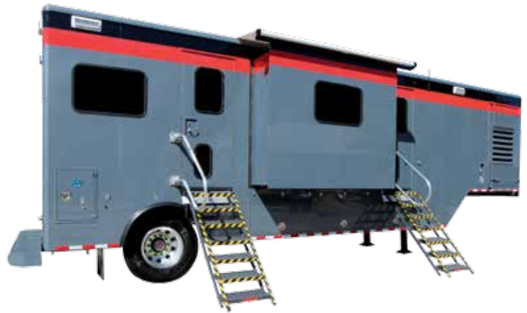
ET-33EXP Trailer Mounted Data Acquisition and Control Center